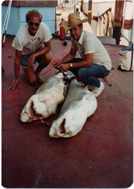
He swam with the sharks