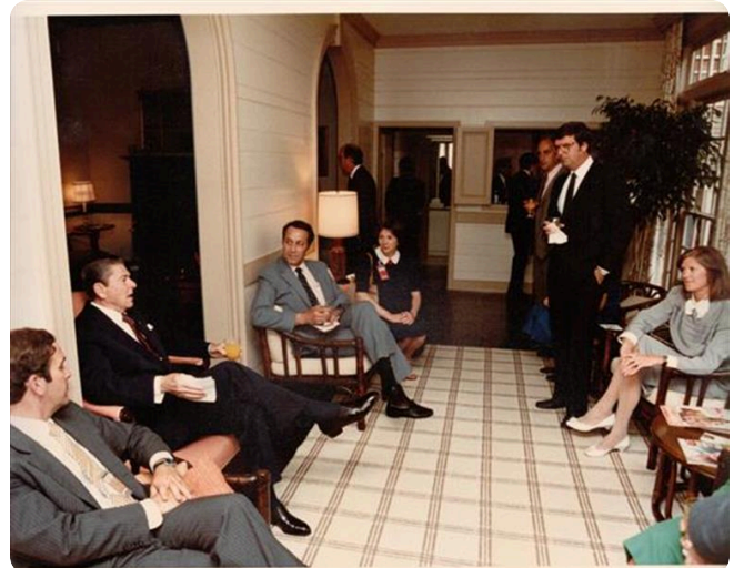
Official White House Press Photo