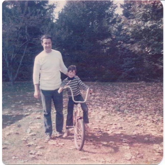
A great dad, great memories